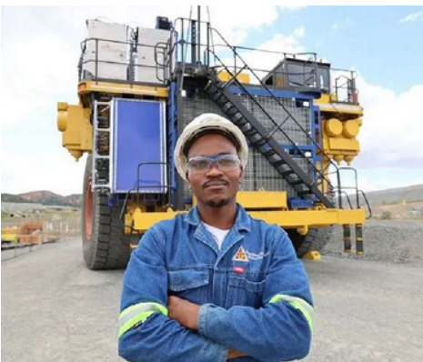
Heavy Equipment Operators