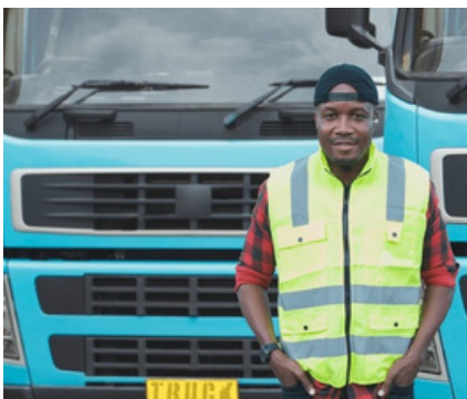
Heavy Duty Drivers